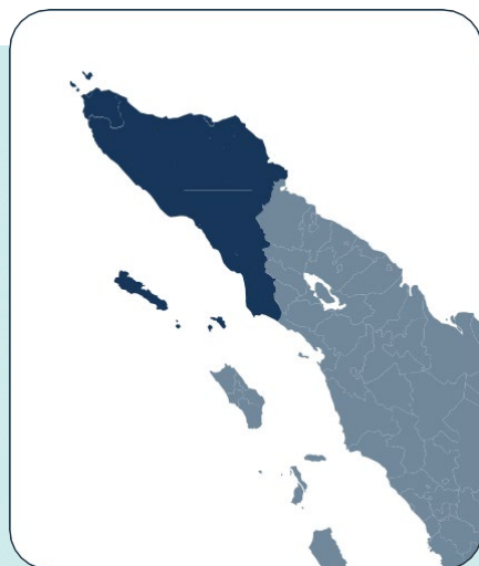
Figure 1. Key Administrative Data

SKALA 1 works with the Aceh Provincial Government to strengthen the participation of vulnerable groups in development planning, as well as to improve the use of reliable data and analysis, increase regional financial capacity, and strengthen the quality of public spending. SKALA's Aceh office became operational in January 2023.